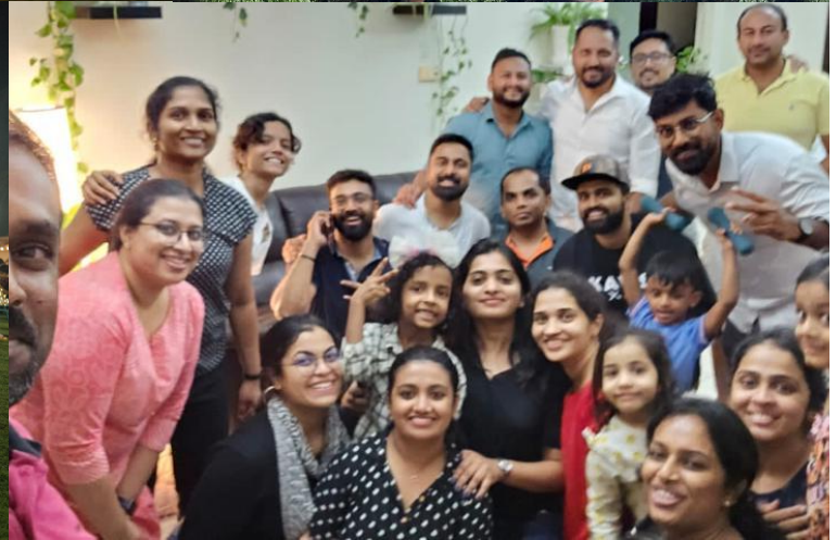
A night to remember - Here are some snapshots of the wonderful evening we shared.