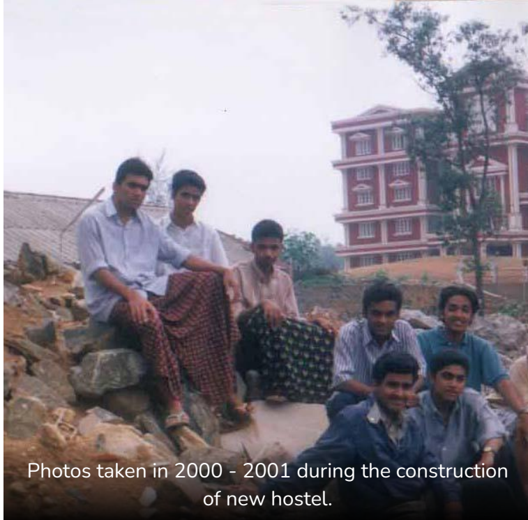
Photos taken in 2000 - 2001 during the construction of new hostel.