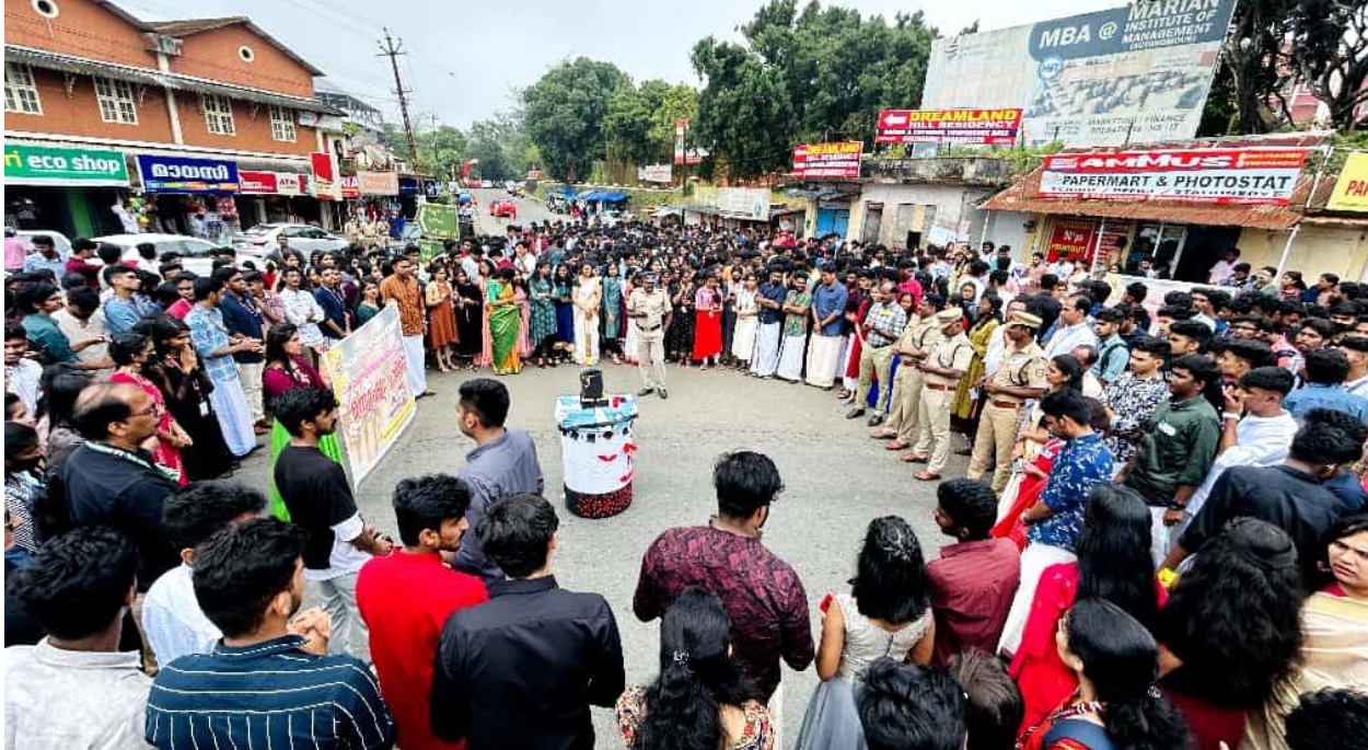
TELECASTED CM's MESSAGE ON THE 2nd ROUND ANTI-NARCOTIC CAMPAIGN